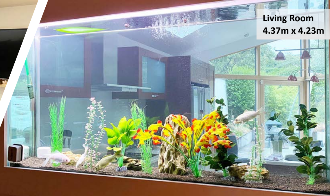
Living Room 4.37m x 4.23m