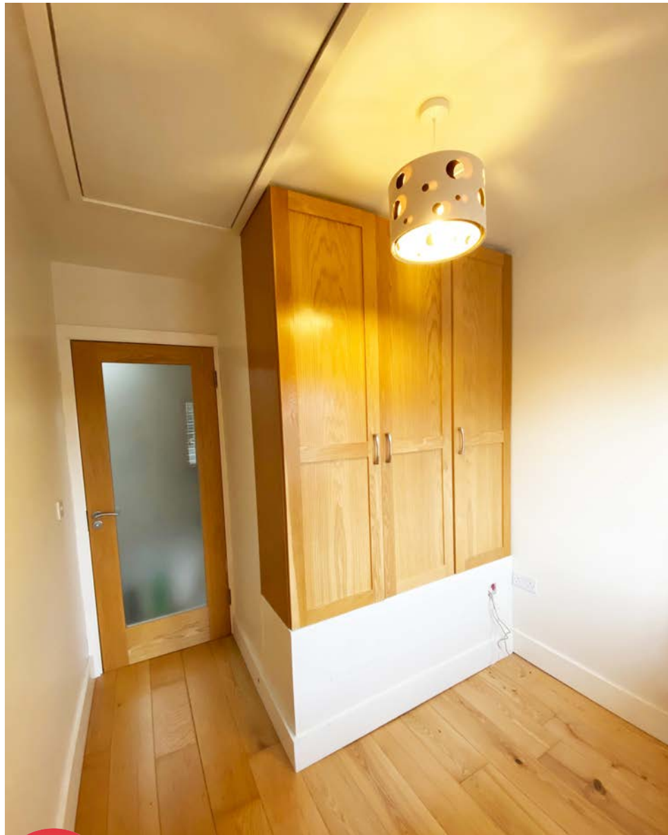
Bedroom 3 3.96m x 3.46m