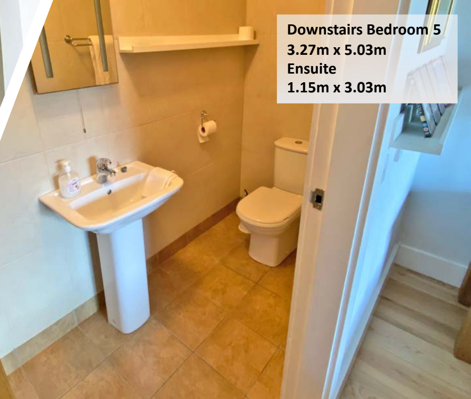
Downstairs Bedroom 5 3.27m x 5.03m Ensuite 1.15m x 3.03m