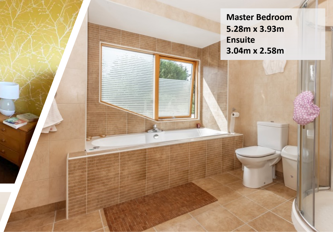
Master Bedroom 5.28m x 3.93m Ensuite 3.04m x 2.58m