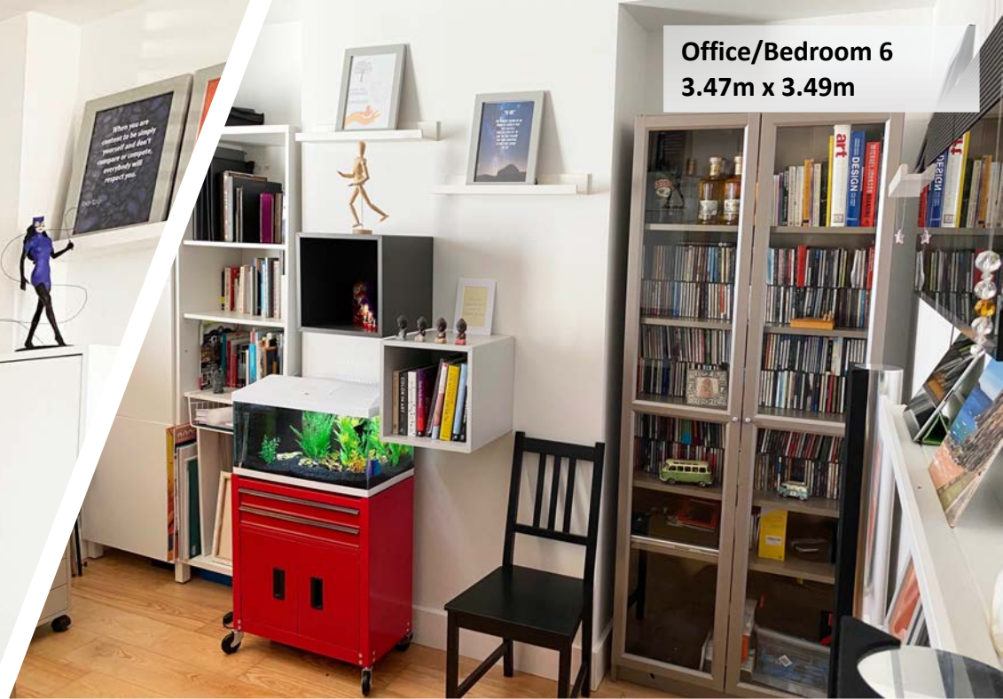
Office/Bedroom 6 3.47m x 3.49m