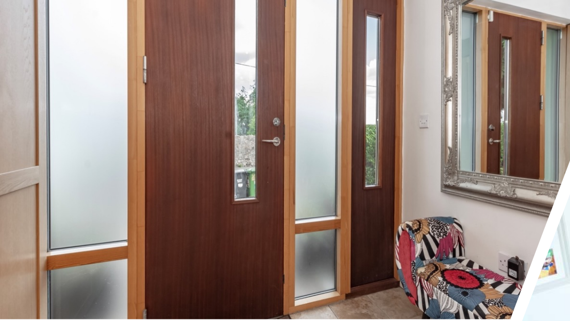
Entrance Porch 4.97m x 3.11m