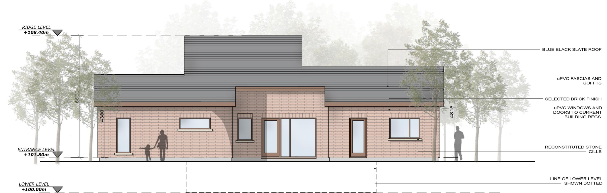
REAR ELEVATION SCALE 1 : 100