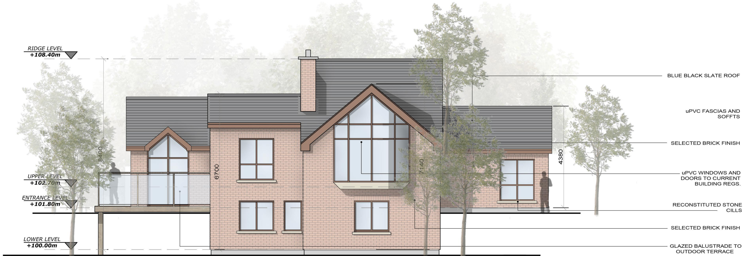
FRONT ELEVATION SCALE 1 : 100