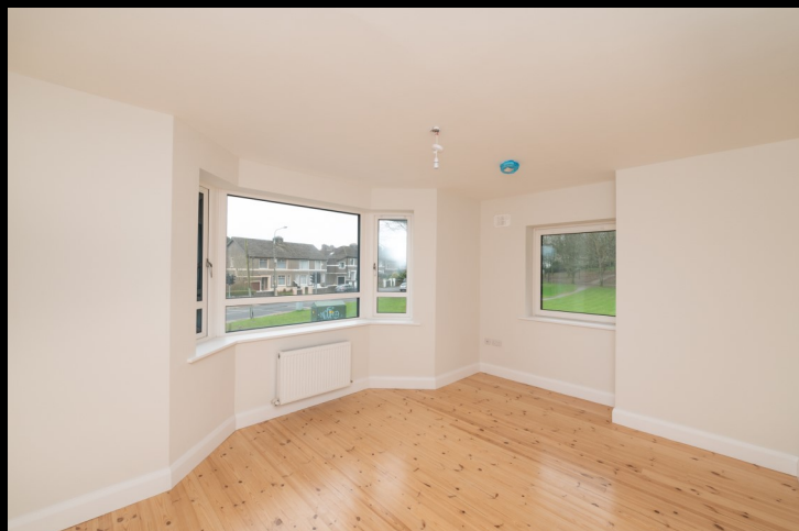
Master bed Room