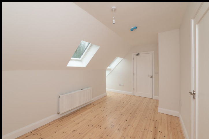
2nd Floor Bedroom/Studio