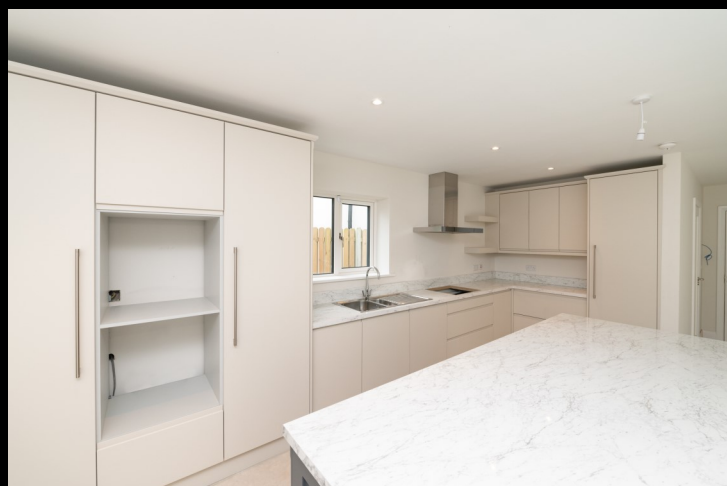
Fitted Kitchen with Island