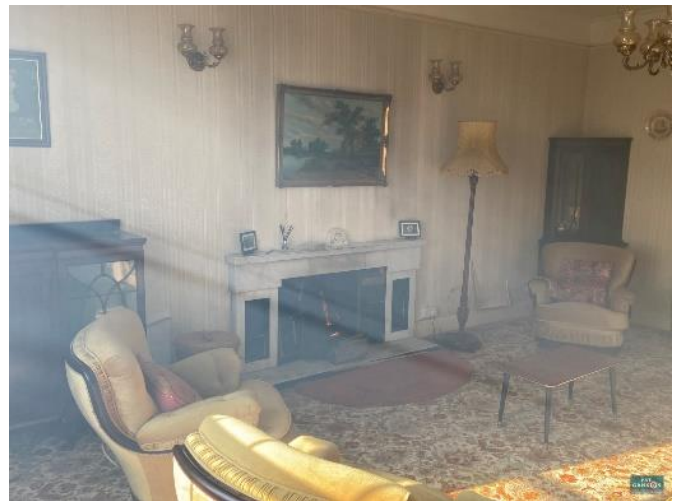
Study 11'04 x 10'02 (3.4 x 3)