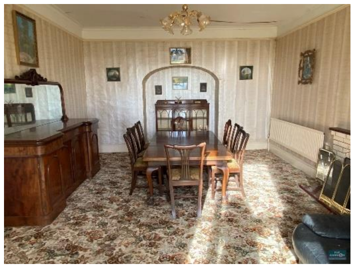
Sittingroom 21'03 x 14'10 (6.4 x 4.3) fireplace, carpet flooring. Coving with centre piece.

Another large room with 9'09" ceilings and open marble