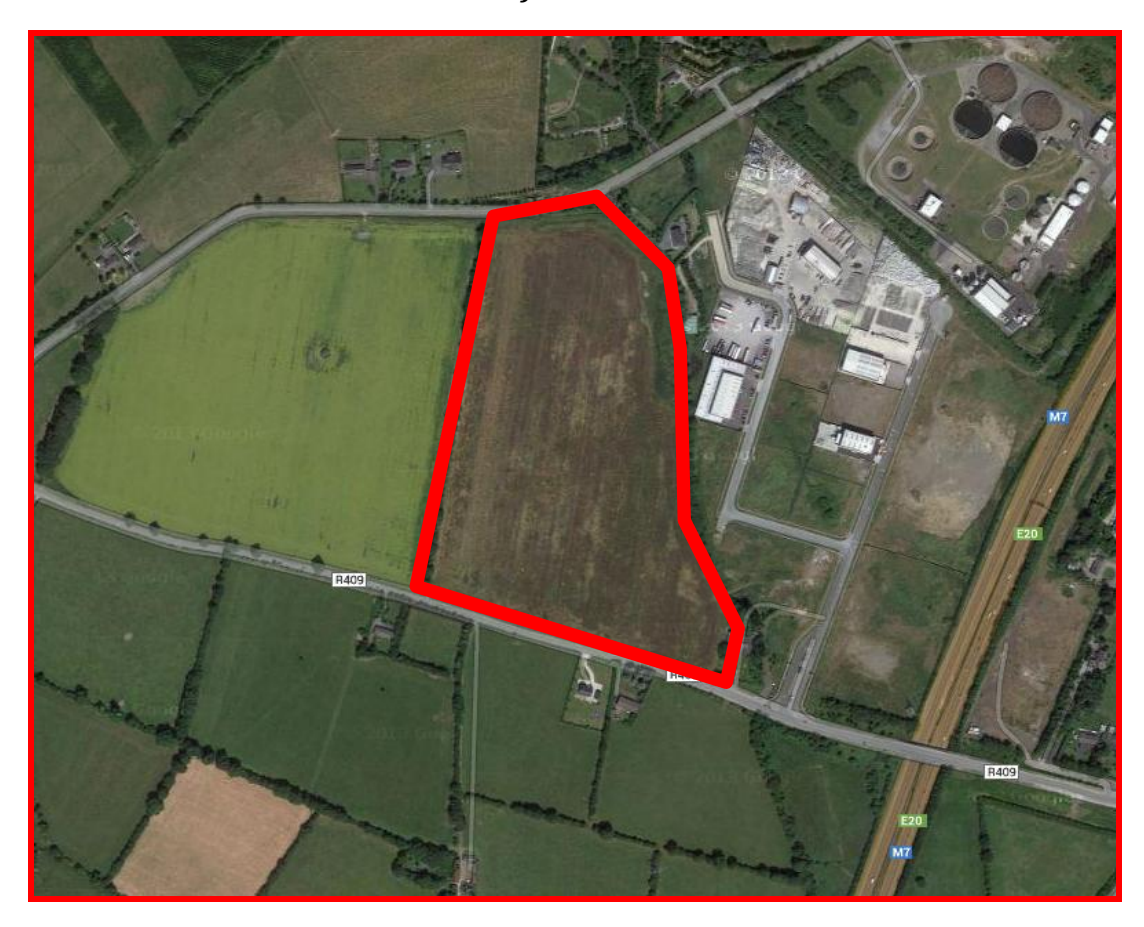
2.5km Naas, 32km Dublin.