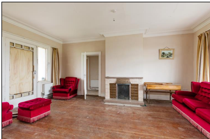
Main reception room