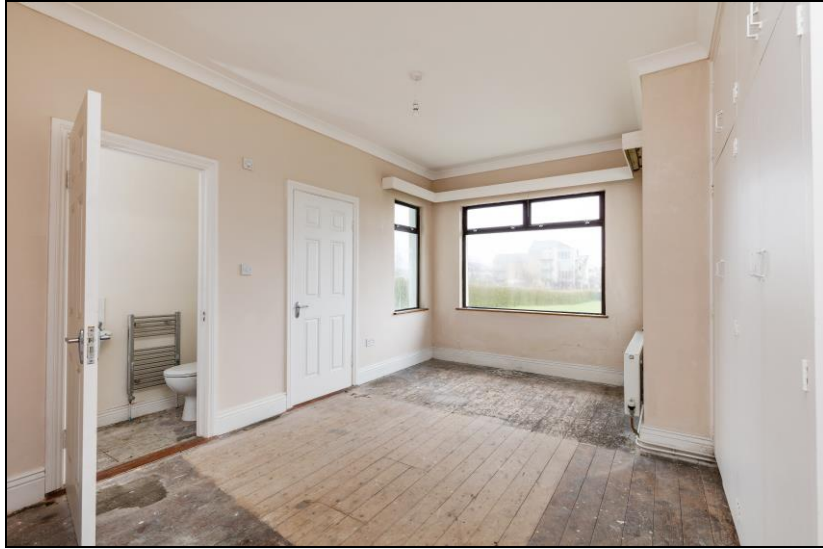
Bedroom with En Suite