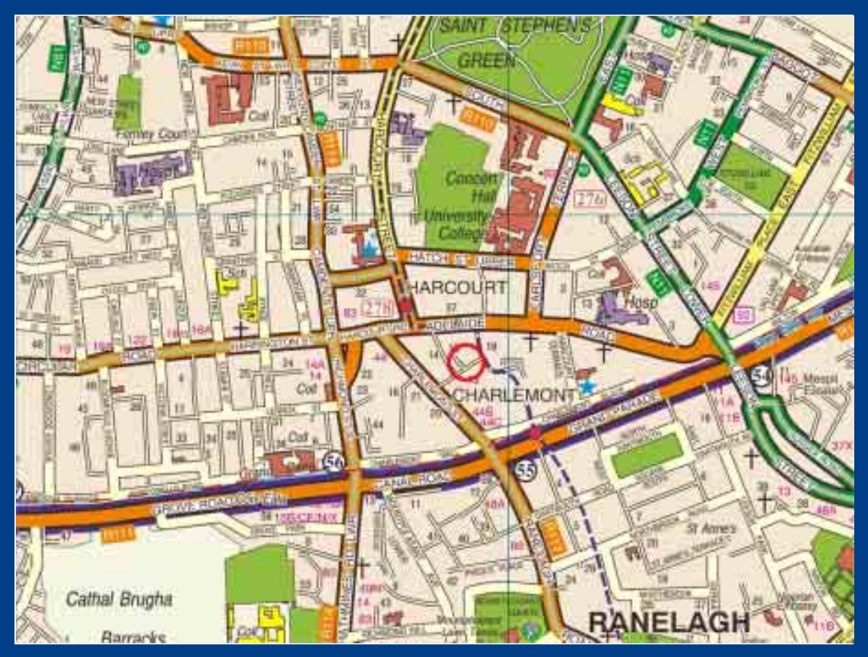
Ordnance Survey Ireland Licence No AU 0011701 £ Government of Ireland