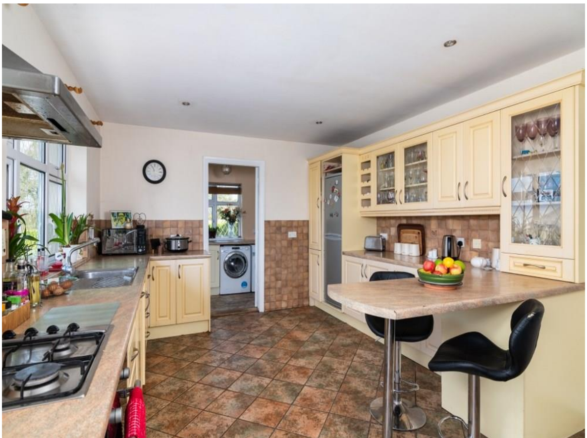
Ardmore, Donamon, F42 VY03